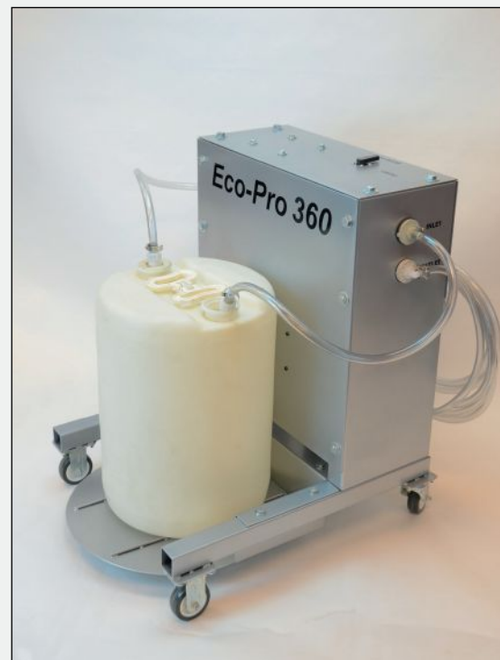
iD Additives photos

“Jose brought me in to show him the product and its capabilities and to help them implement a baseline for preventative maintenance going